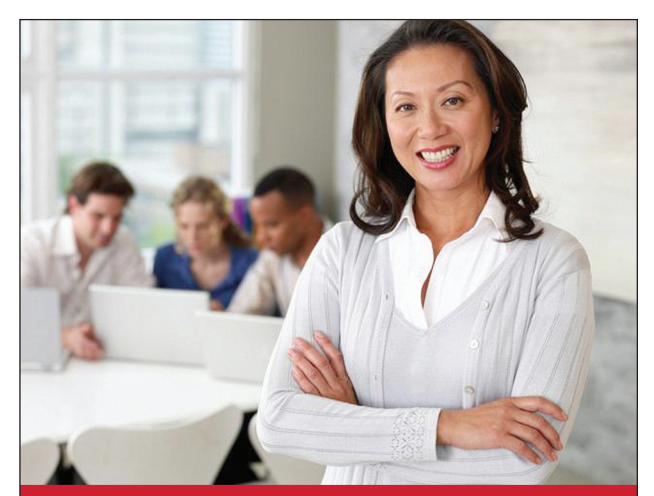
Named #1 Real Estate Franchise by Entrepeneur Magazine www.franchise-remax.com Franchise Opportunites are available in your area.

The other issue that sometimes arises in a transaction with multiple offers is that the property may not appraise for the bidded up price being offered by the winning bidder. As such, the benefit to the seller of having multiple buyers bidding up the price of the property can be lost. One way that sellers can try to minimize this risk is to invite all buyers to make their best offers but to then communicate that only contracts with the following special stipulation included will be considered.