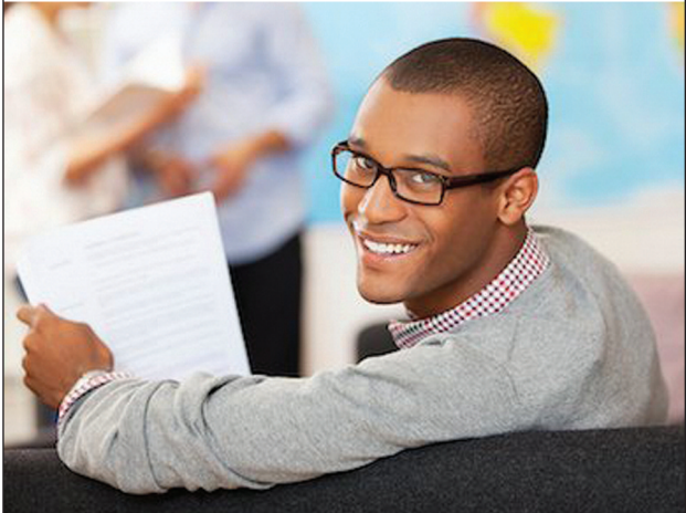
Take Control of Your Career with RE/MAX! Scan the QR Code and see why you need to Join Team RE/MAX.